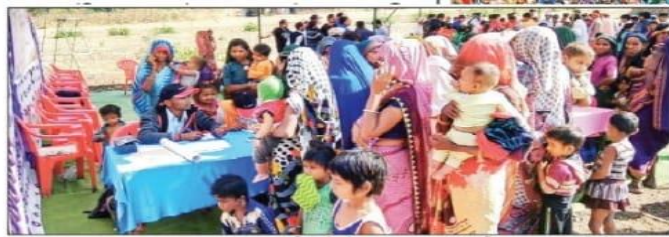
बड़वानी। शिविर में स्वास्थ्य परीक्षण करते चिकित्सक।